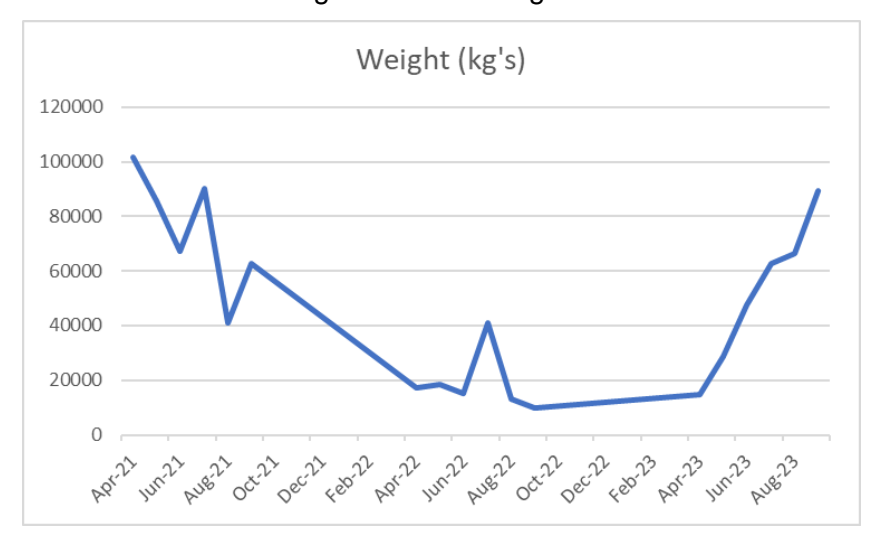
Shellfish Landings Scarborough & Whitby Harbours

The transition to the new authority has been challenging for the Harbours Service with a multitude of new processes and procedures being adopted during the busiest time of year. This has led to some significant pressure across the service and a number of key members of staff have left the Council. Work continues to recruit into the vacant posts and align the service with the Council's target operating model, streamlining processes as the service moves forwards.